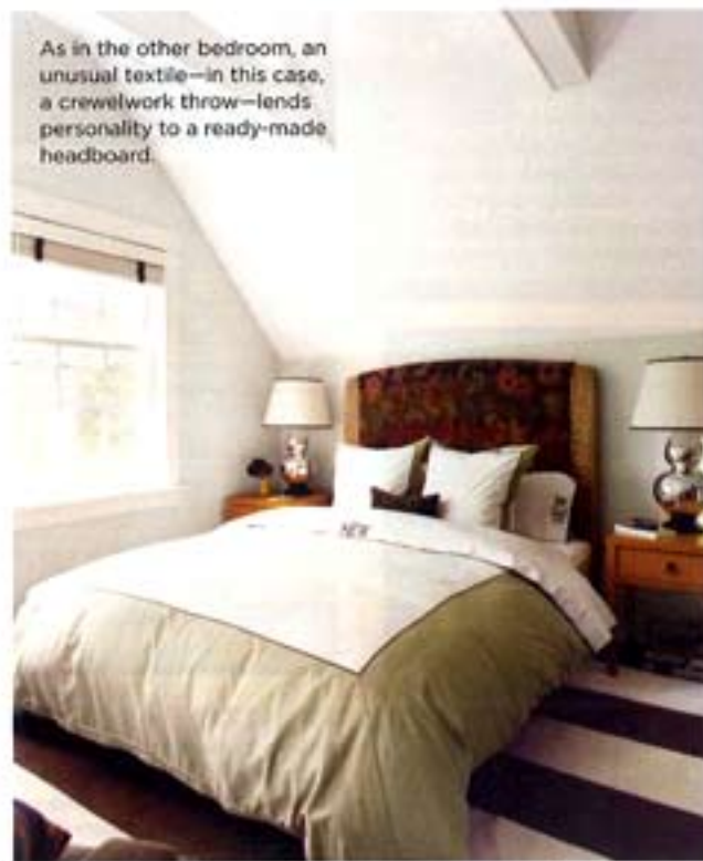
As in the other bedroom, an unusual textile—in this case, a crewelwork throw—lends personality to a ready-made headboard.