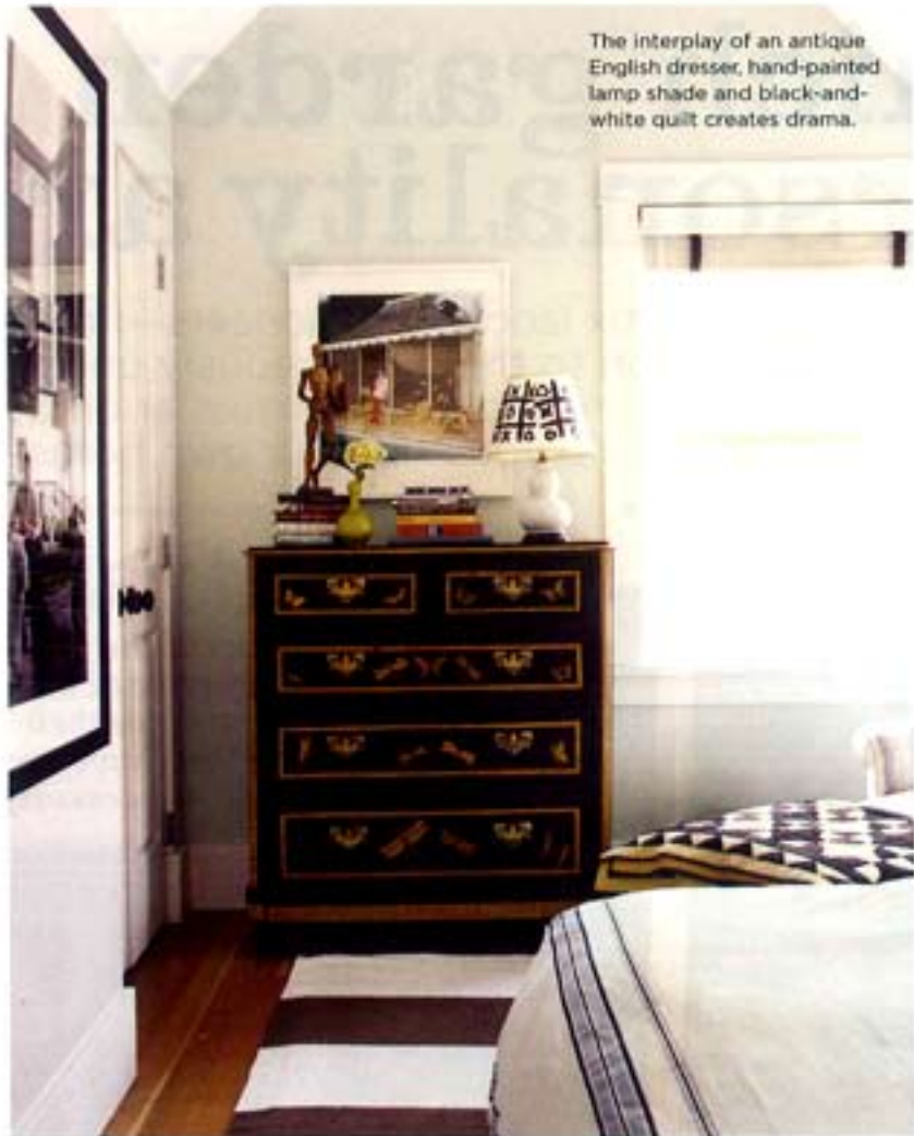
The interplay of an antique English dresser, hand-painted lamp shade and black-and-white quilt creates drama.